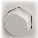
IP67 pressure relief vent