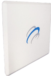
Larger panel antenna w/ silkscreened logo